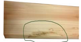
image highlights a non-finished area). Notice the top “finished edge” is placed upward and the non-finished side inward so it is covered by the growing medium.

Stain your cedar planters for protection from the sun’s UV rays. If you want to retain the natural cedar look, there are some clear or “neutral” stains on the market designed strictly for protection without colorization. Just make sure the stain you select contains UV inhibitors. UV damage is one of the leading causes of cedar wood discoloration, leading to a gray, washed-out look.